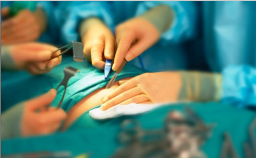
New and Innovative Surgical Procedures

By offering the most advanced technology and the latest minimally invasive surgical techniques, patients face less pain, less risk, and less recuperative time. Therefore, the patients can go home on the same day as their procedure.